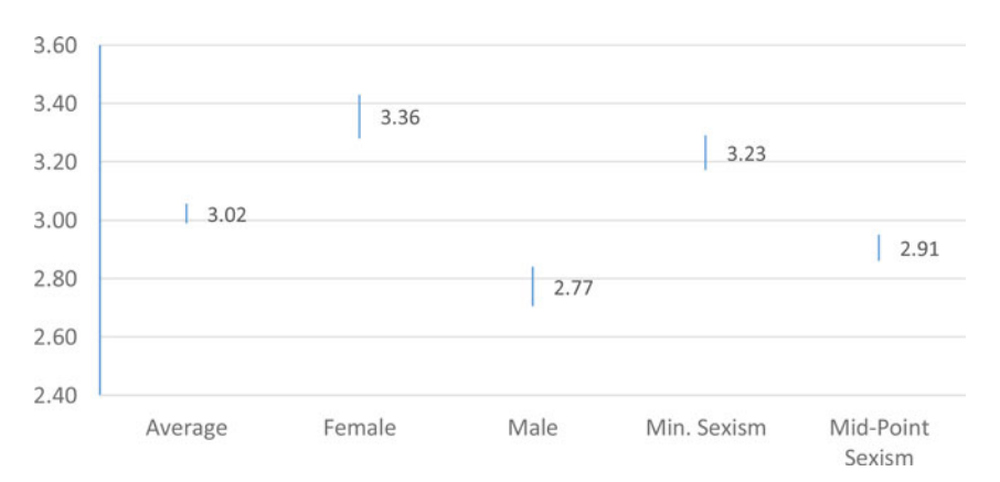
FIGURE 2. Protecting Sexual Harassment Infrastructure In Response to COVID-19 Crisis

to the COVID-19 pandemic. First, across most items, men and women respond similarly (with the exceptions of attitudes toward cutting women's teams and coaches' salaries). Second, though, we see substantial differences in protecting Title IX compliance (e.g., equality of athletic opportunity) and maintaining the infrastructure for sexual harassment, both between women and men and compared with other priorities. Here, similar to the foregoing results, we see notable gender disparities that are statistically significant (p < .01). For women, these